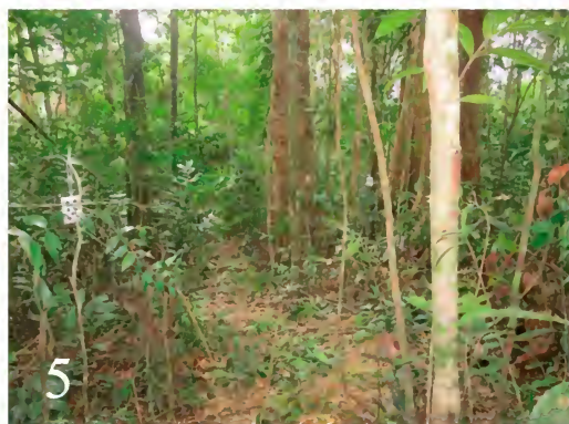
Figures 4-5. Scenery of collecting sites (900 m alt.) in Hon Ba National Park, Vietnam.